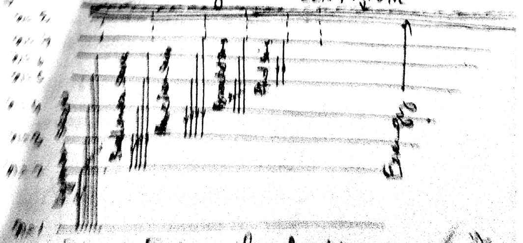
Fig. 2 (b) energy level diagram.