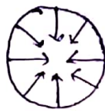
spherical shape of liquid drop